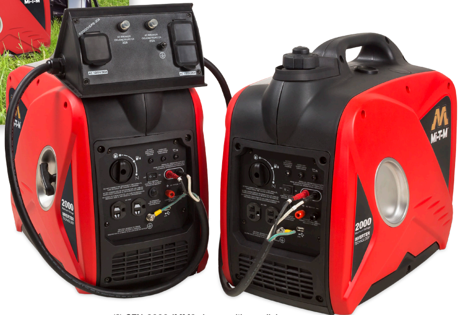
(2) GEN-2000-IMMO shown with parallel port box accessory, AW-5100-0001