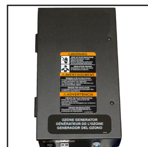
Ozone generator for a "quick kill" of live bacteria on contact (WCL-30D-OM10 only)