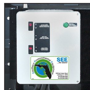
CSA listed NEMA-4 rated corrosion-proof control panel for safe and reliable operation (WCL-30D-OM10 only)