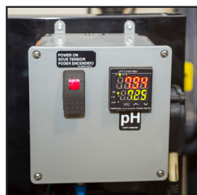
Optional pH controller, WX-0130

All options can be added to the WTR Series after the initial set-up.