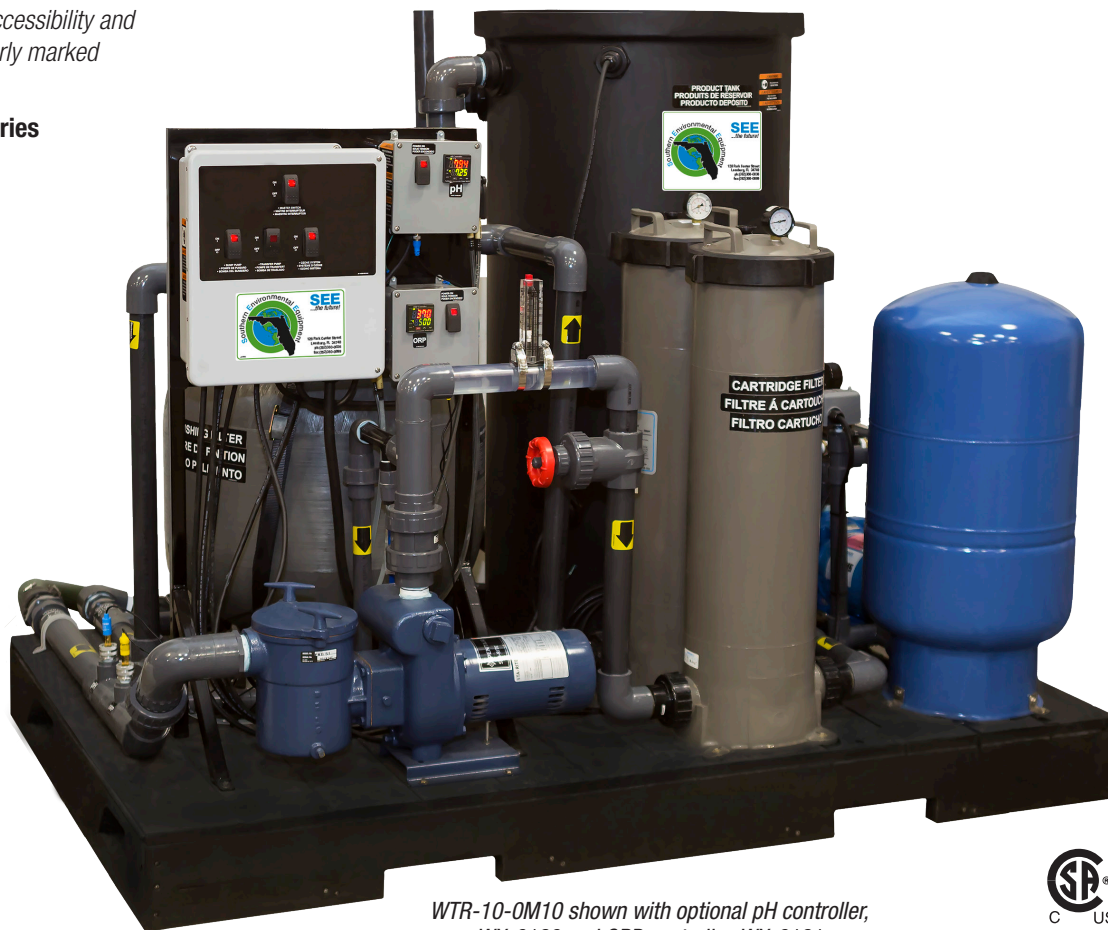
WTR-10-0M10 shown with optional pH controller, WX-0130 and ORP controller, WX-0131