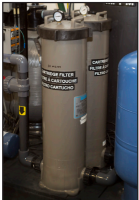
5 and 30-micron filters