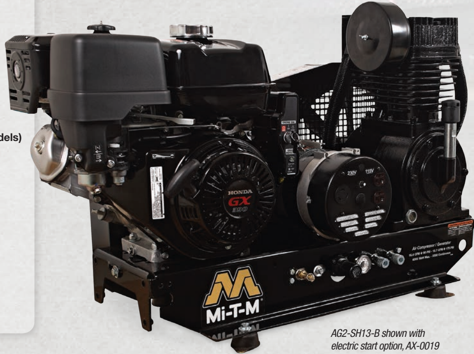
AG2-SH13-B shown with electric start option, AX-0019

The 8-gallon air compressor/generator will run your air and electric tools from one convenient machine. In times of power failure use the generator as a backup power source.